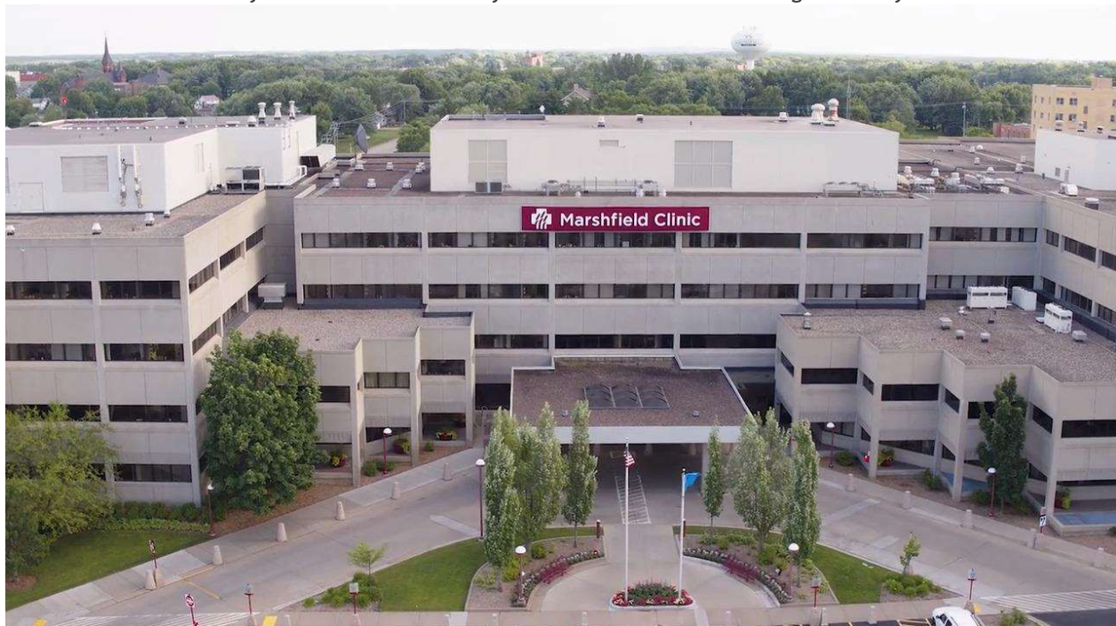
Marshfield clinic 2020

The program also arranged an exchange externship elective cardiology rotation which I will be having this winter in University of Wisconsin health system December 2023 through January 2024.