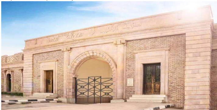
Faculty of medicine – University of Khartoum, 2014

The duration of the program is six years including both theoretical and practical training in various medical disciplines. I have studied basic sciences such as anatomy, physiology, biochemistry, pharmacology, and pathology, and I also received clinical training in different specialties, including internal medicine, surgery, pediatrics, obstetrics and gynecology, psychiatry, and others. Throughout medical school years, I have learned the necessary knowledge and skills to diagnose and treat illnesses, performed basic procedures, and provided supervised primary healthcare.