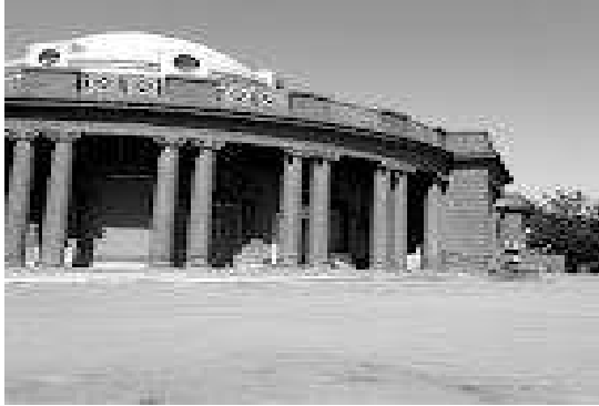
Kitchener medical school - 1924

I obtained my basic medical qualification after completing a medical education program at a university in Khartoum school of medicine. Established in 1924, school of medicine (formerly Kitchener school of medicine named after the famous British governor upon the era of Sudan colonization by UK) is the earliest ever established medical school in Sudan and among the earliest in Africa and middle east.